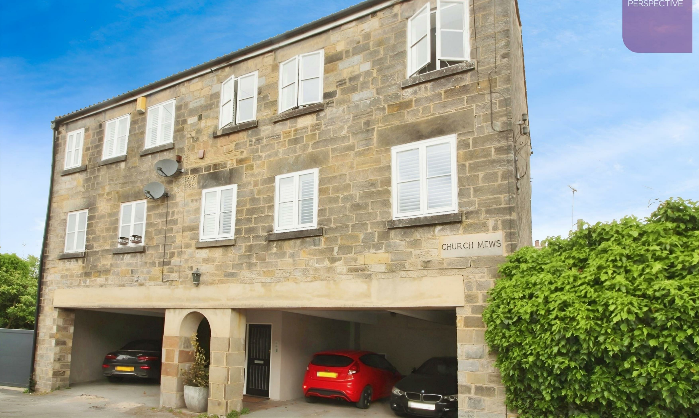
Flat 3, Church Mews Church Lane, Knaresborough, HG5 9AR £169,995