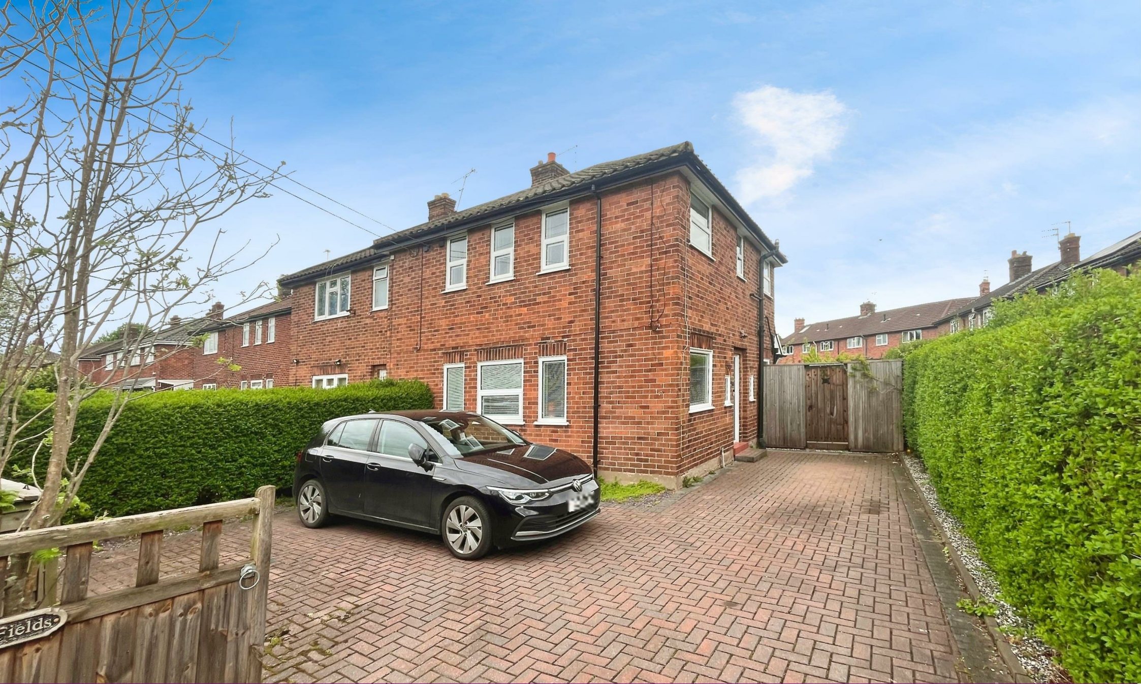
1 Mossfields, Alsager, ST7 2LA £215,000