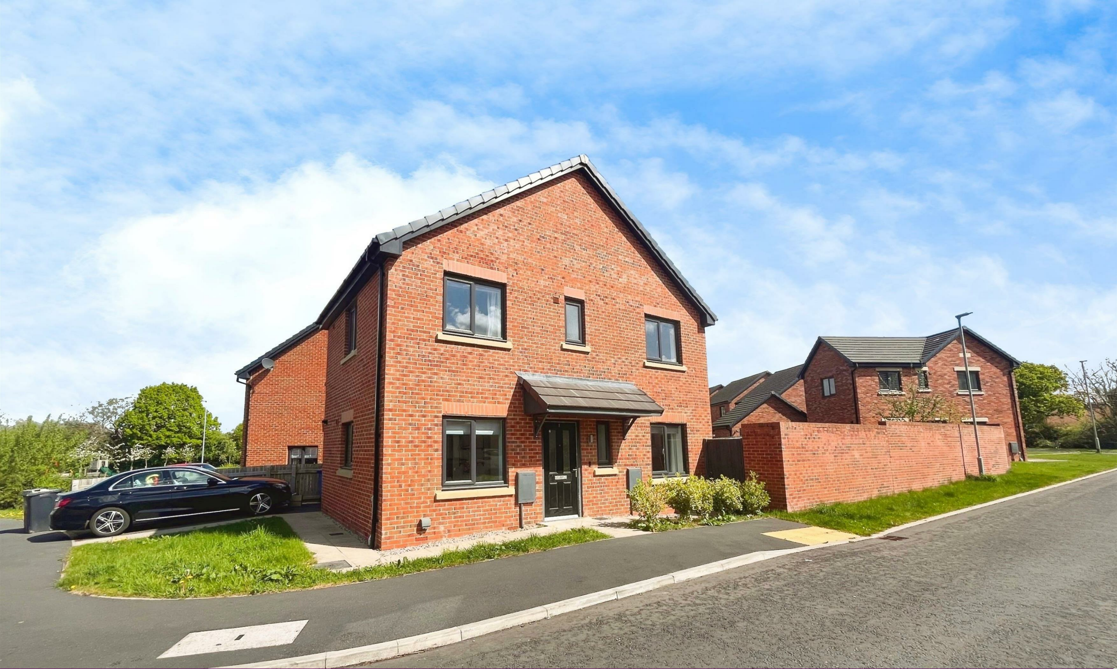
1 Elder Close, Leyland, PR25 1FG £240,000