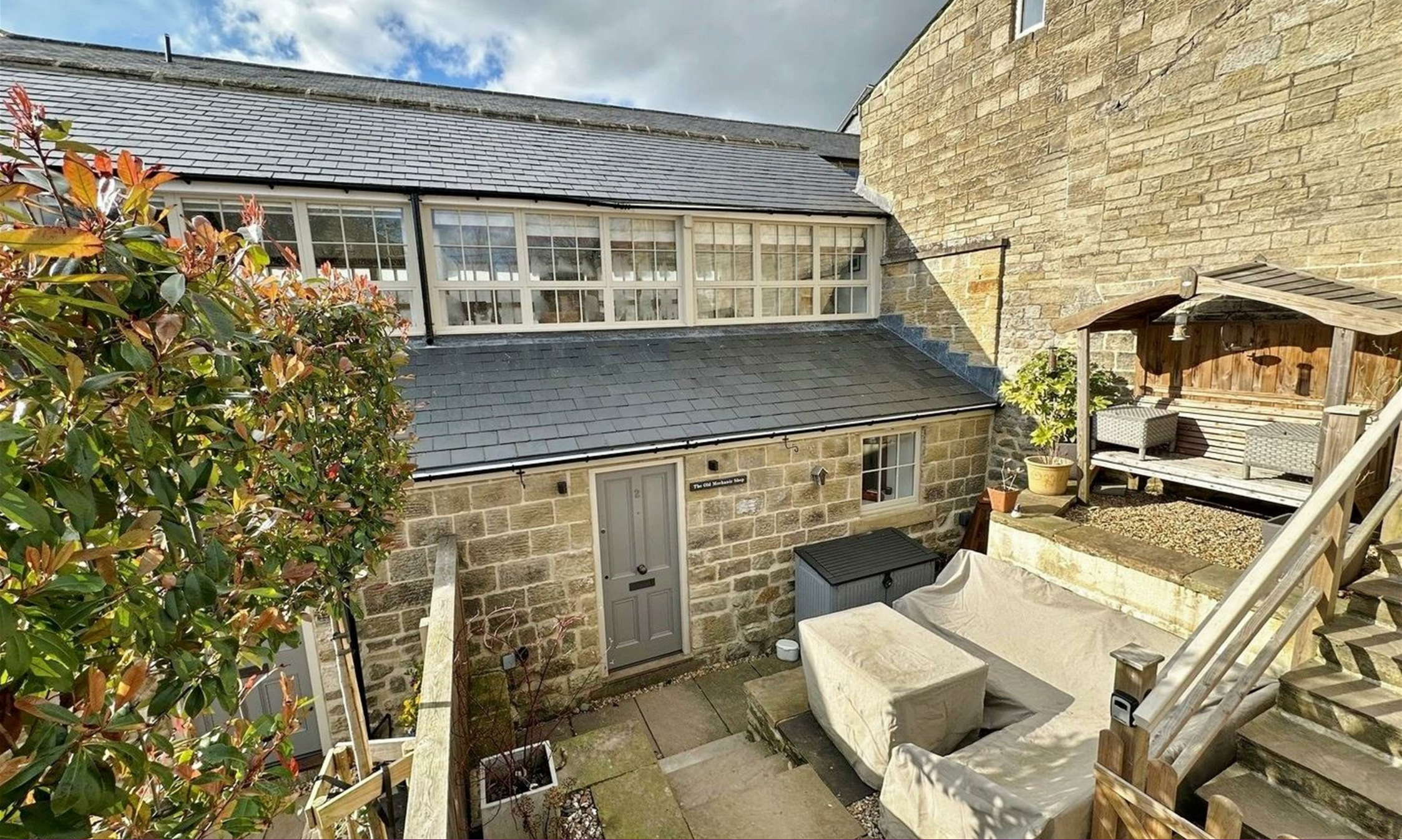
2 Mill Race, Glasshouses Mill Glasshouses, HG3 5AH £263,995