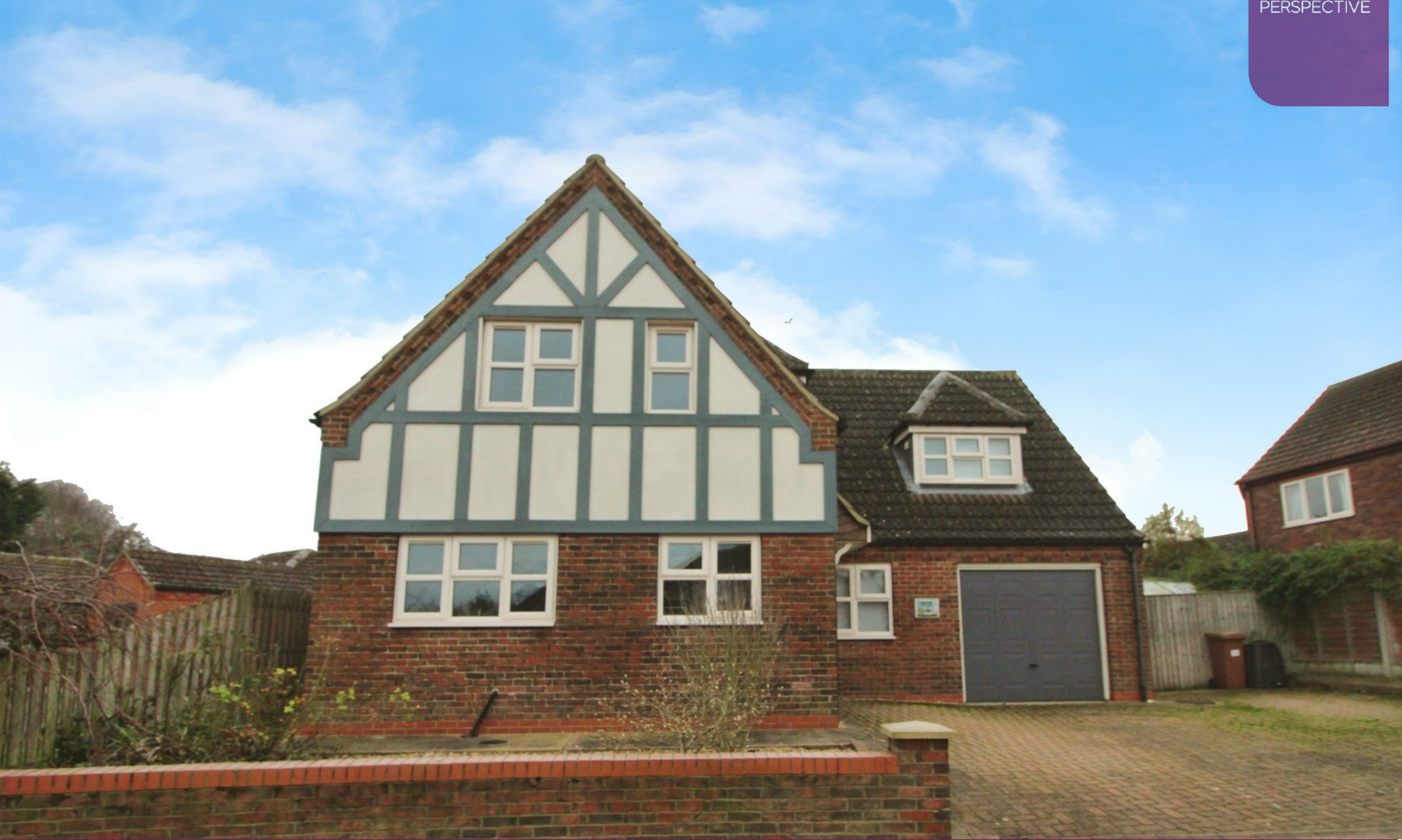
Cavendish Cottage Castle Keep, Hibaldstow, DN20 9JG Offers over £335,000