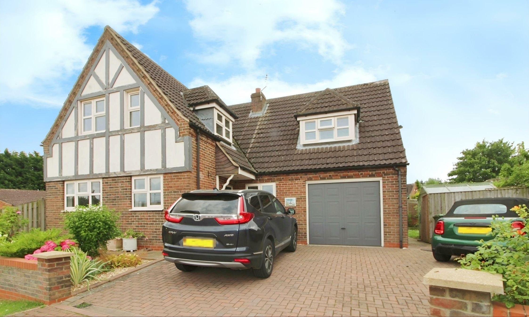
Cavendish Cottage Castle Keep, Hibaldstow, DN20 9JG Offers over £335,000