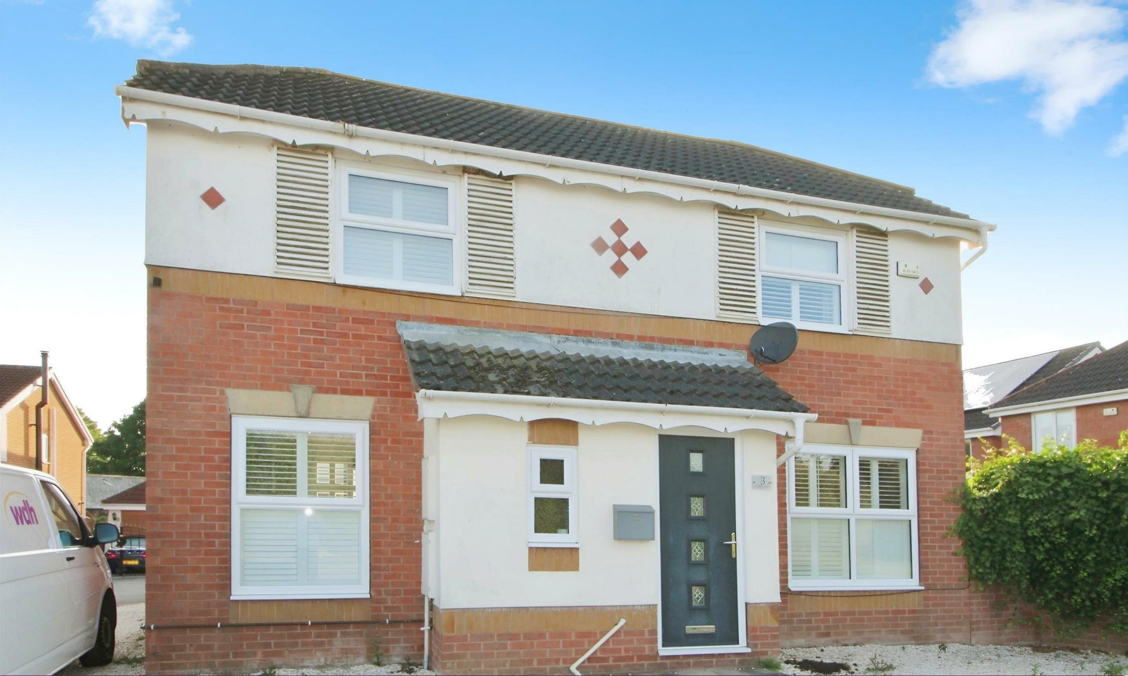
3 Priory Ridge, Crofton, WF4 1TF £274,995