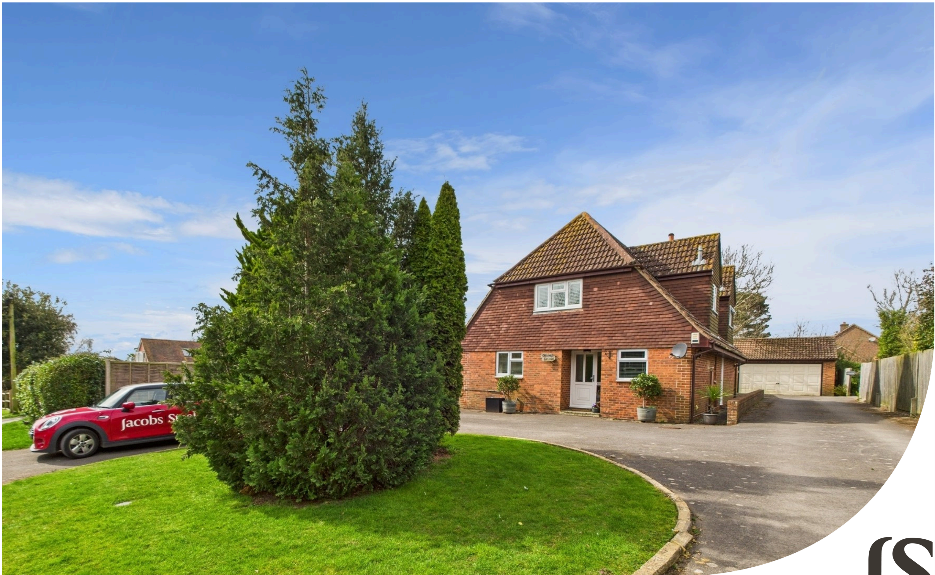
Orchard Cottage | Mill Lane | High Salvington | BN13 3DJ Guide Price £750,000