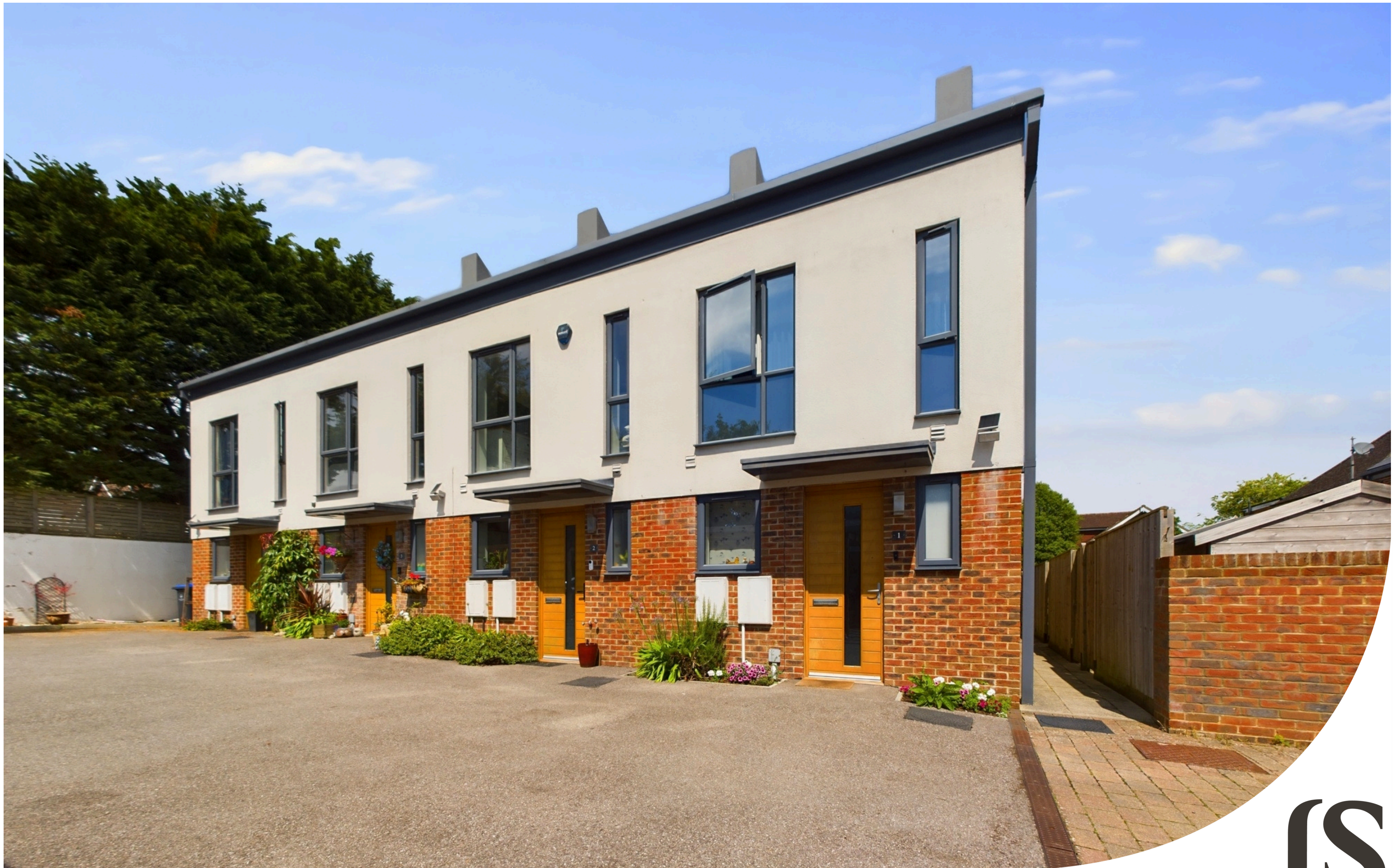
Argyll Mews | Findon Valley | BN14 0AY Offers Over £350,000