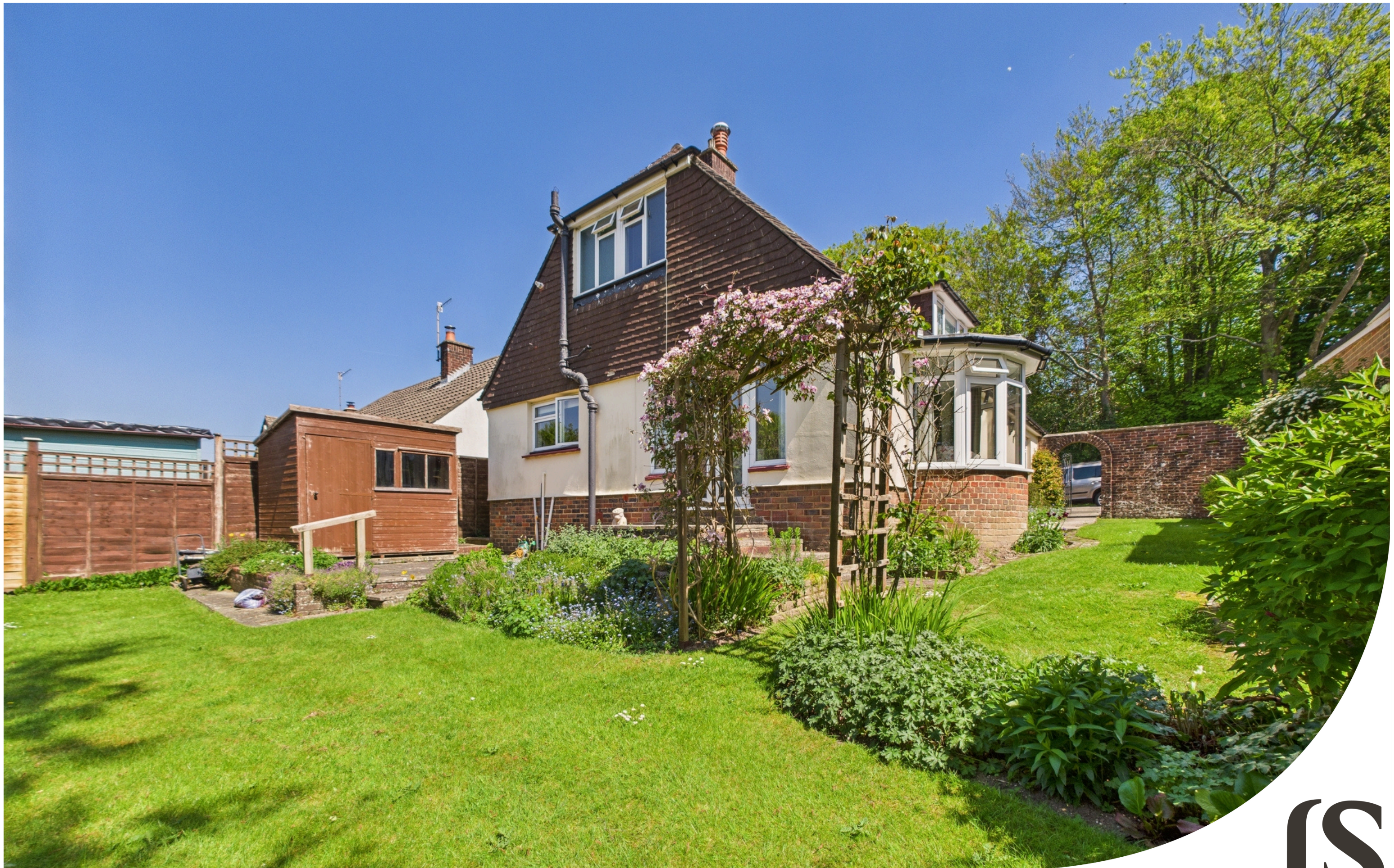
Cross Lane | Findon Village | BN14 0UB Guide price £575,000