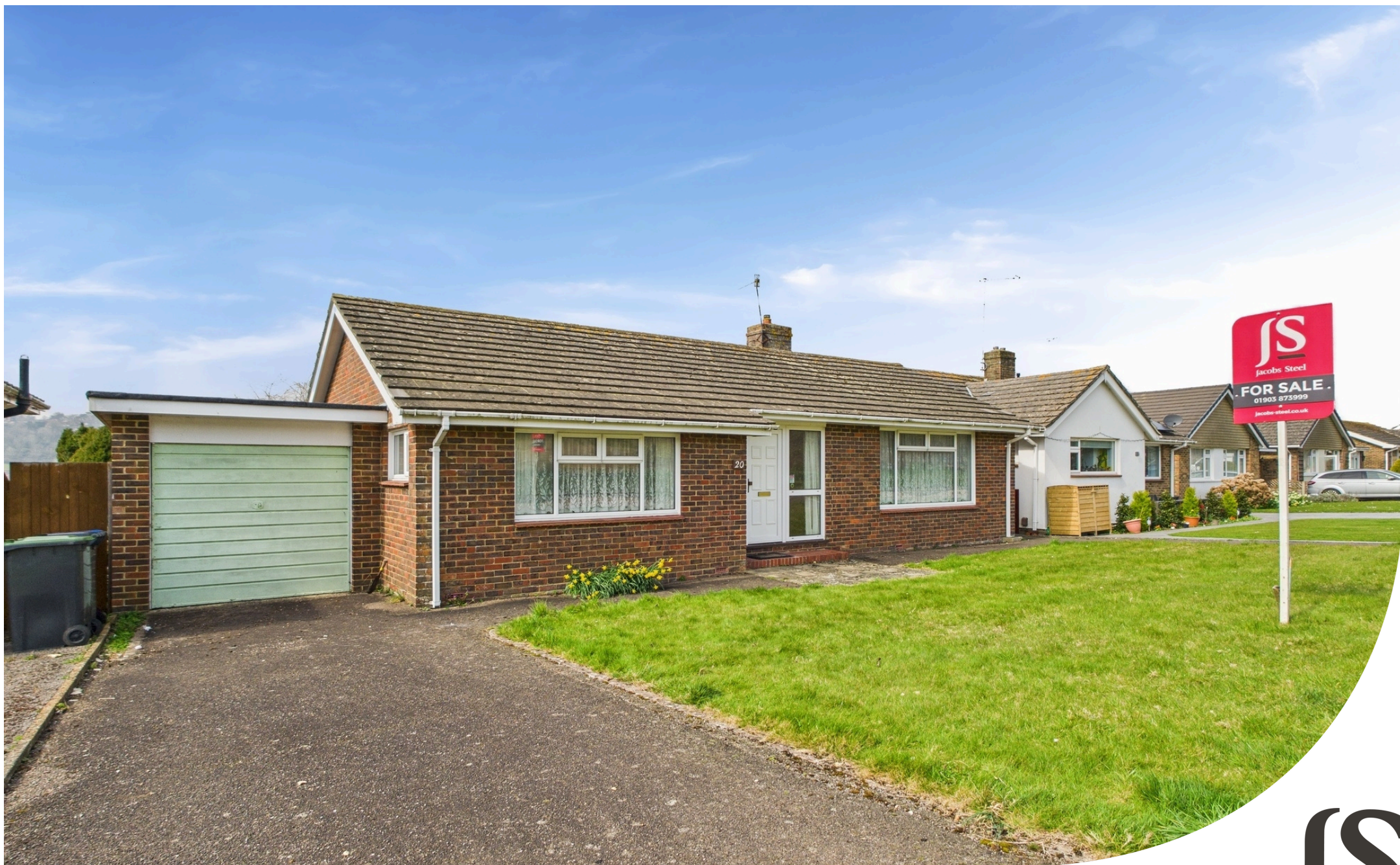
Shepherds Mead | Findon Valley | Worthing | BN14 0JA Guide Price £525,000