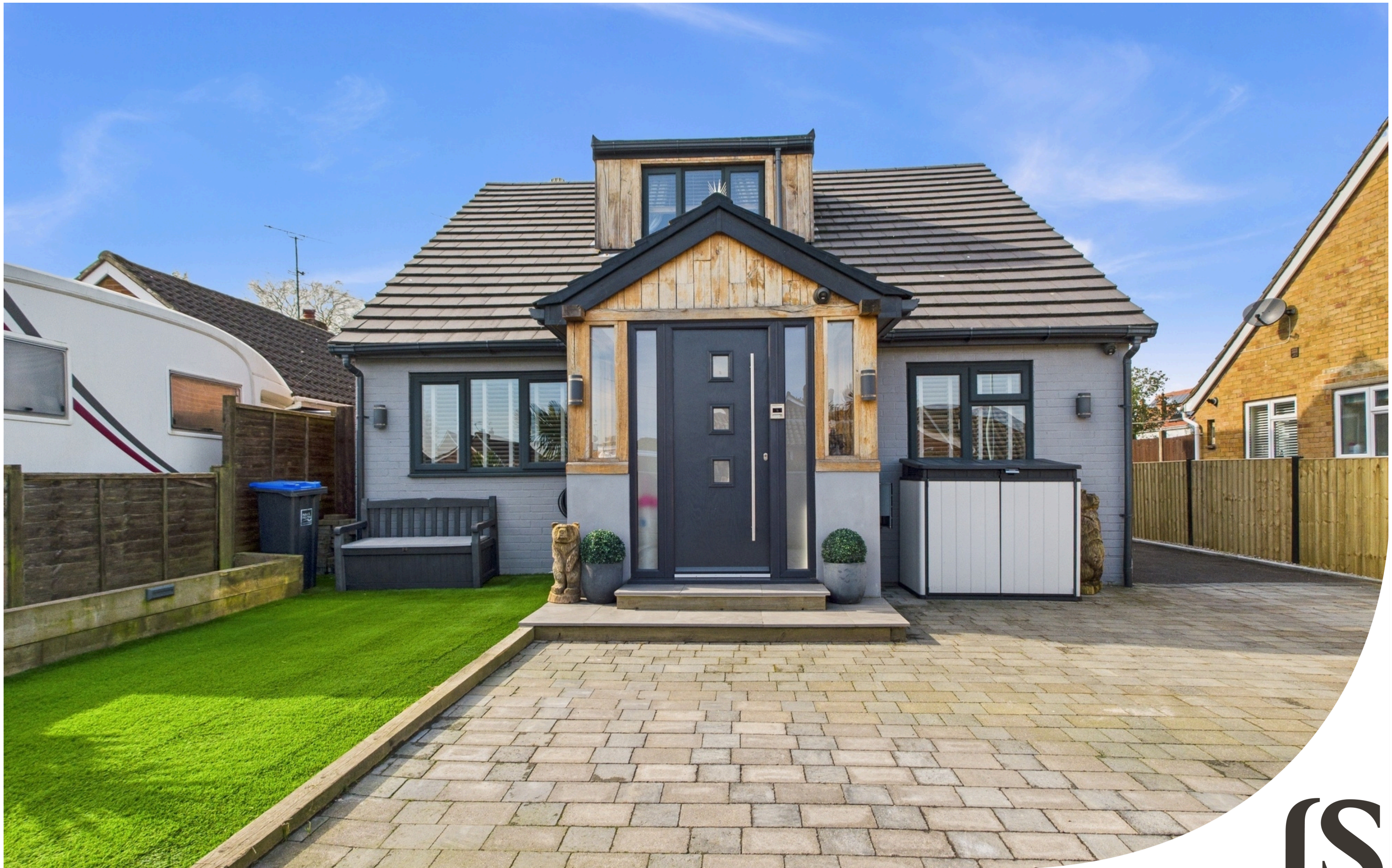
Cuckfield Crescent | Salvington | BN13 2EB Guide Price £750,000