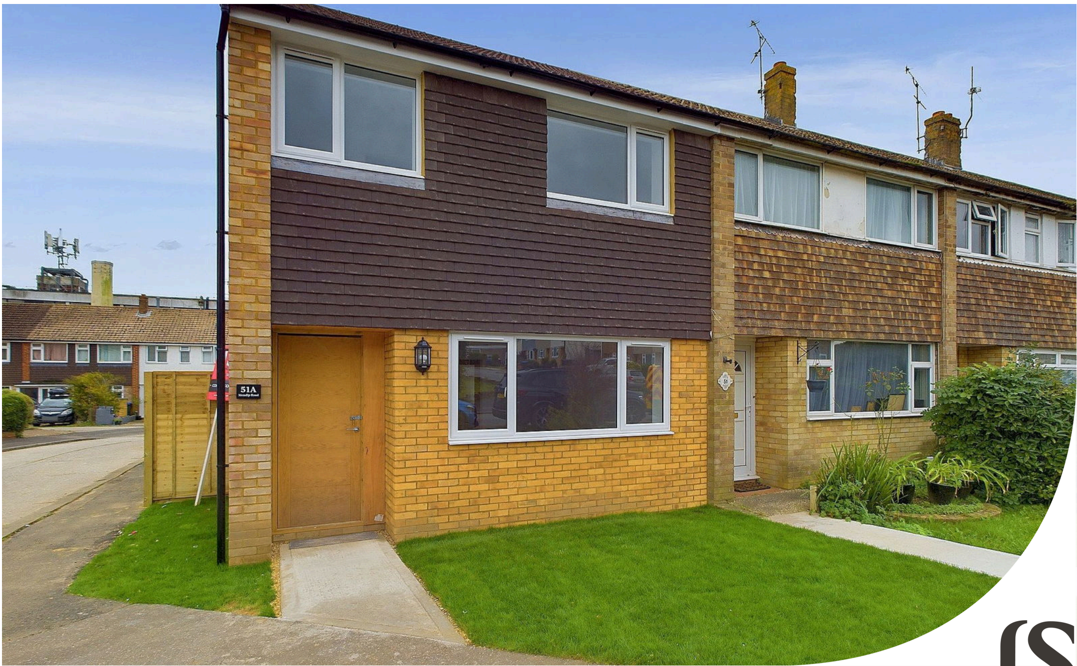
51a Mendip Crescent | Salvington | Worthing | BN13 2LR Guide Price £340,000