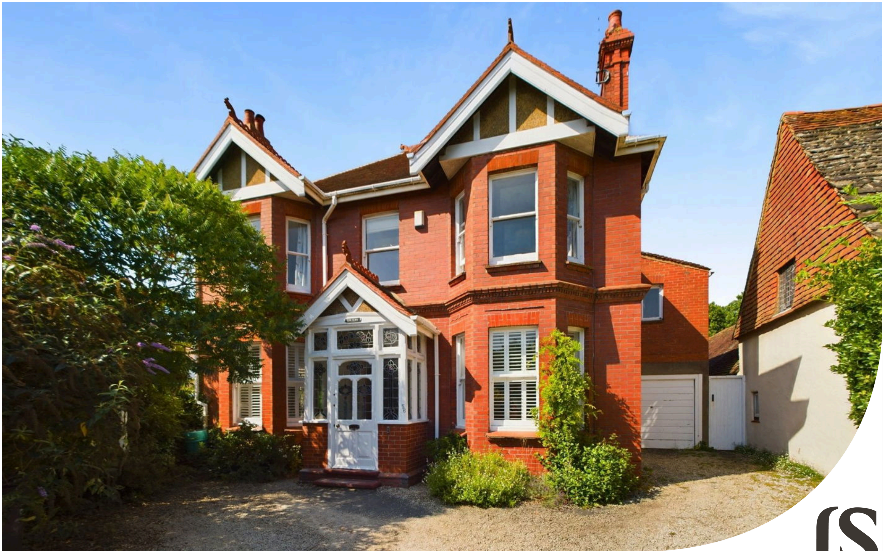
Ashacre Lane | Worthing | BN13 2DE Guide Price £800,000