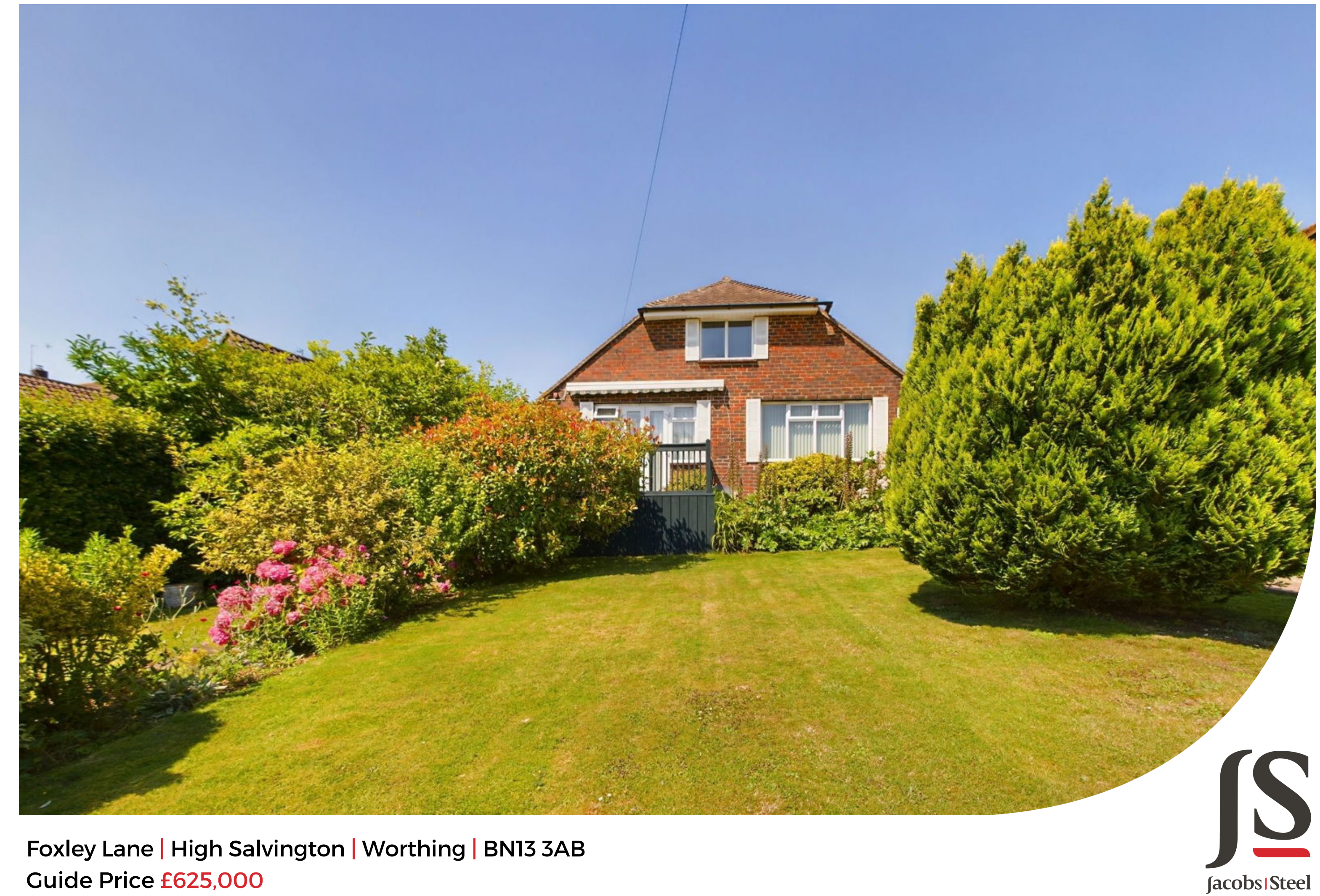
Guide Price £625,000