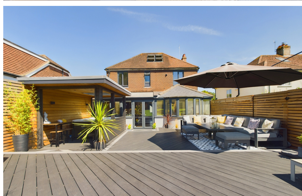
Property details: Findon Road | Findon Valley