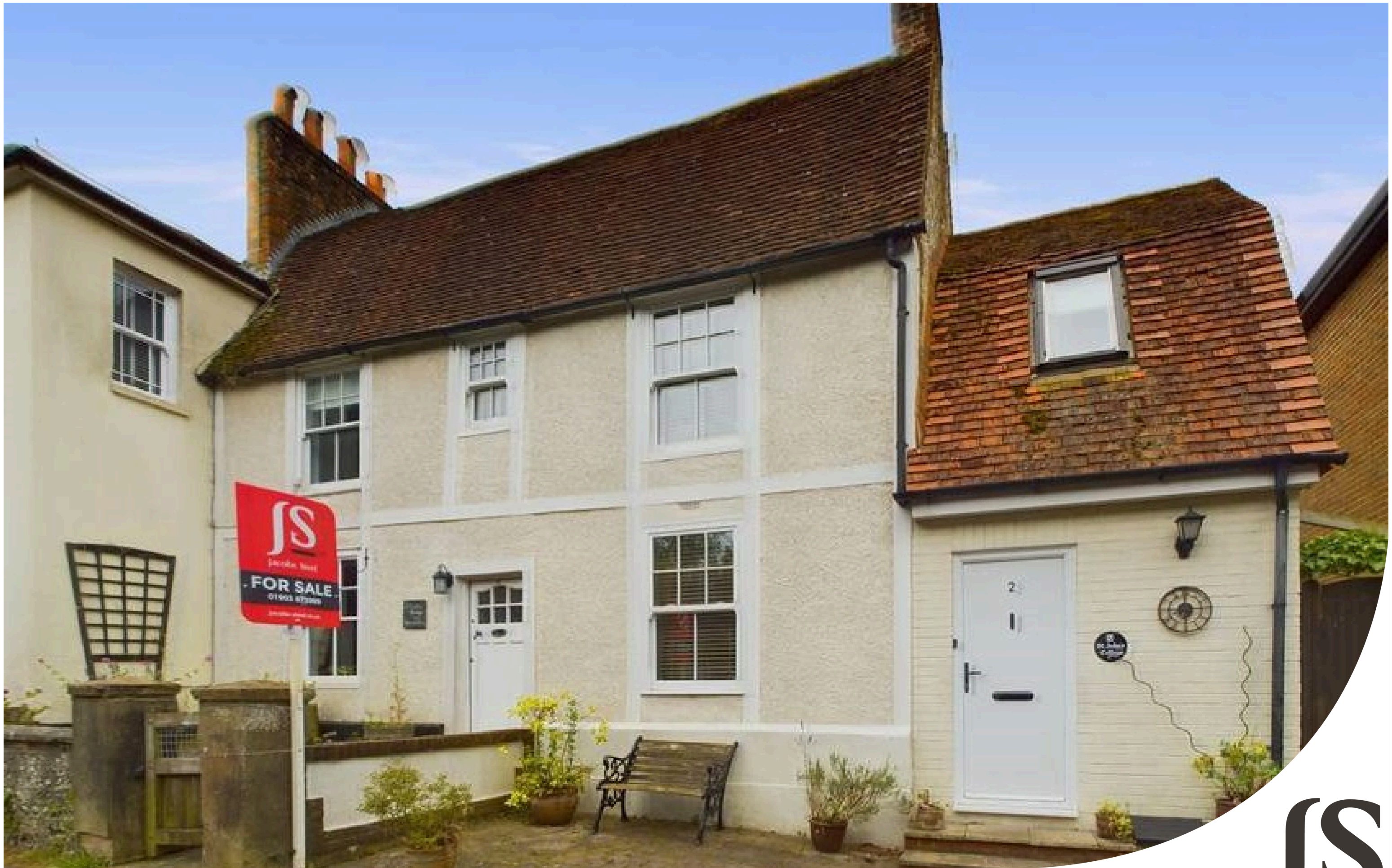
Nepcote Lane | Findon Village | BN14 0SF Offers Over £325,000