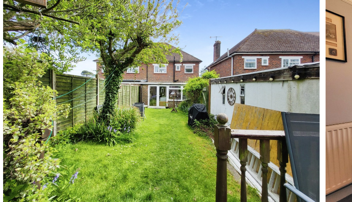
Property details: The Plantation | Worthing

We are pleased to present to the market this semi-detached house situated in the popular Offington area. The property comprises three bedrooms, lounge, kitchen, dining room, conservatory and modern shower room. Front and rear gardens, garage and close to local amenities.