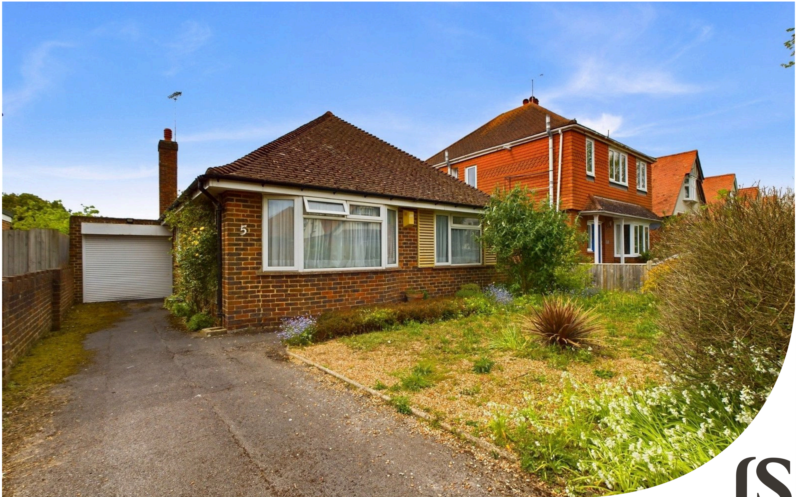
The Glen | Worthing | BN13 2AD Guide Price £475,000