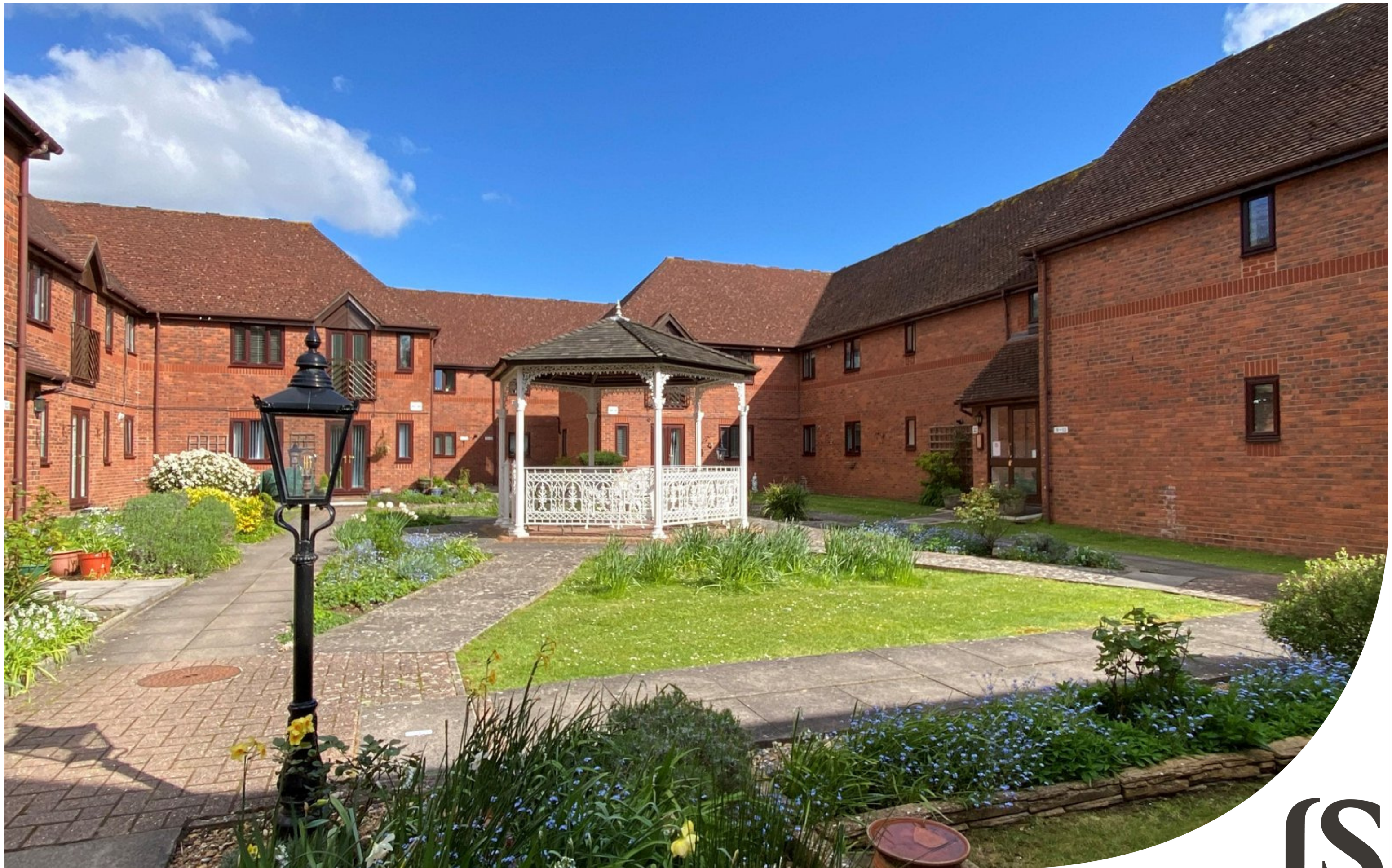
The Courtyard, Offington Lane | Worthing | BN14 9RT Guide Price £185,000