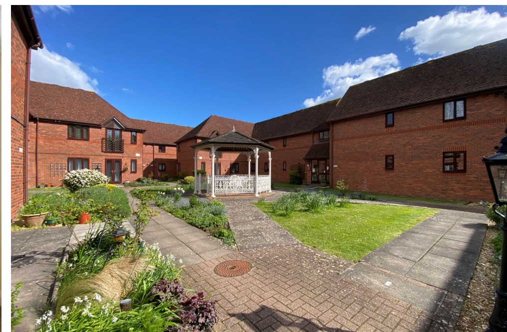
Property details: The Courtyard | Worthing