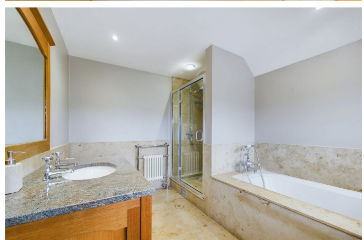
Property details: Rosegarth | Allendale Avenue | Findon Valley | BN14 0AH