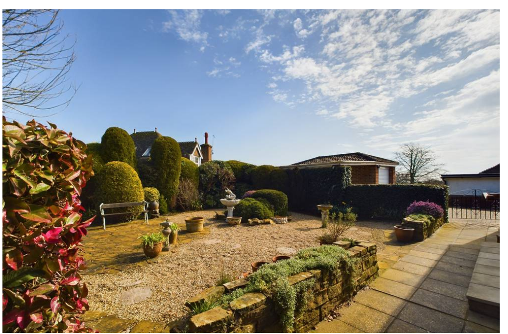
Property details: West Hill | High Salvington