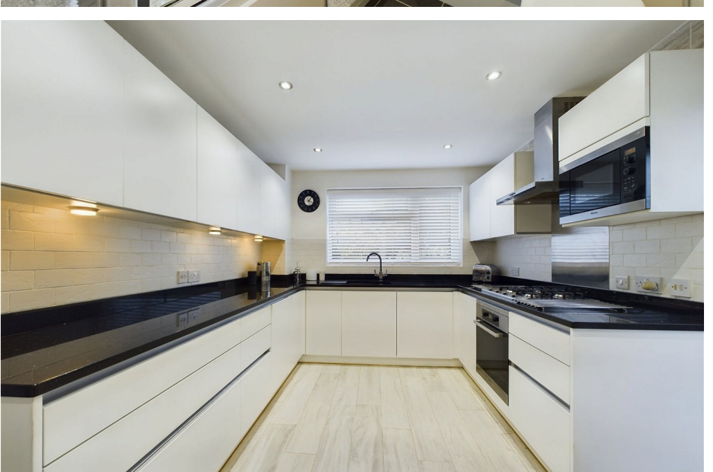
Property details: Welland Road | Worthing