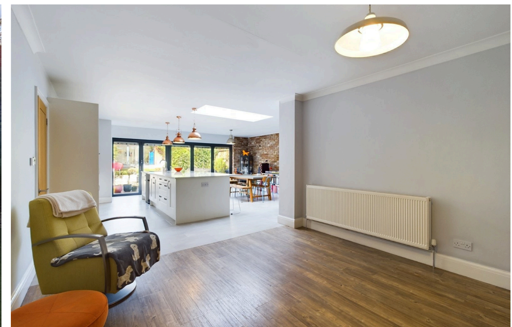
Property details: Goodwood Road | Worthing