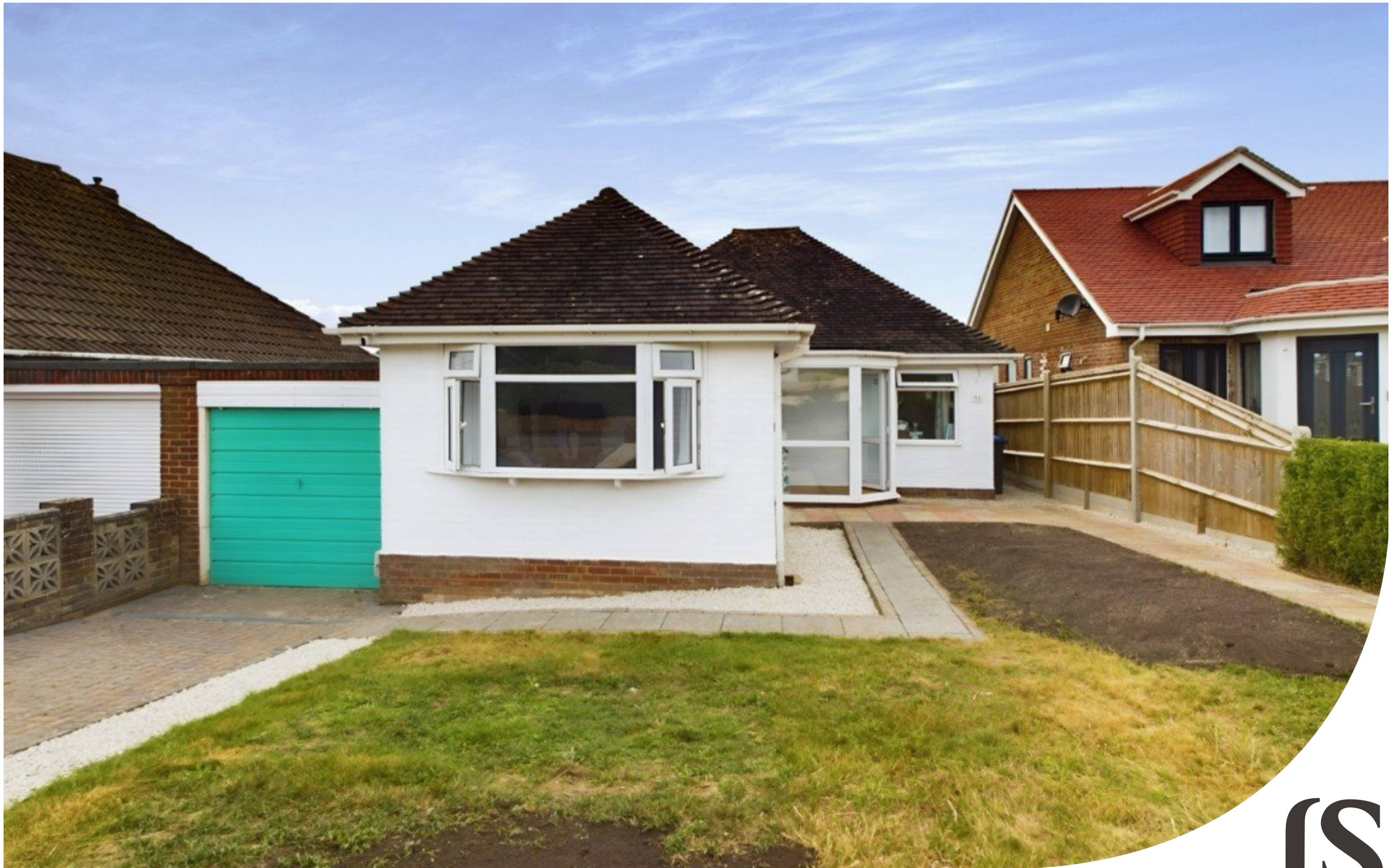
Hollingbury Gardens | Findon Valley | BN14 0EB Guide Price £600,000