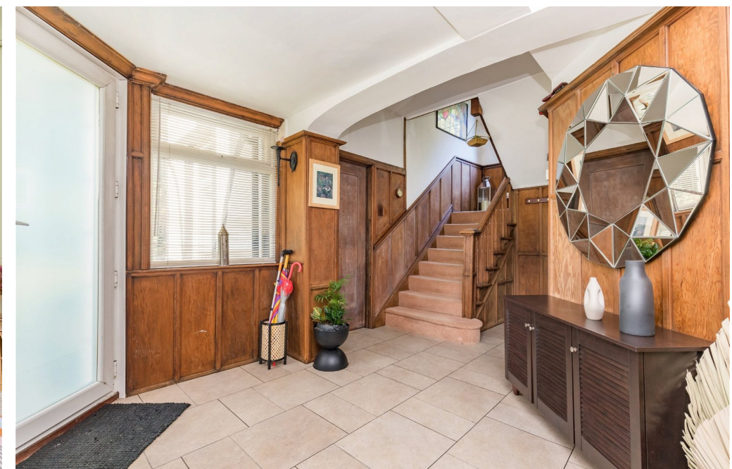
Property details: Warren Road | Offington | BN14 9QX