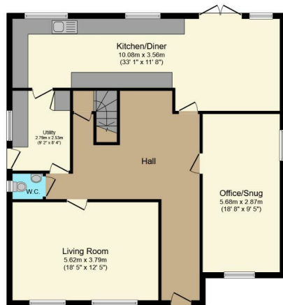
Ground Floor Floor area 108.2 sq.m. (1,165 sq.ft.)