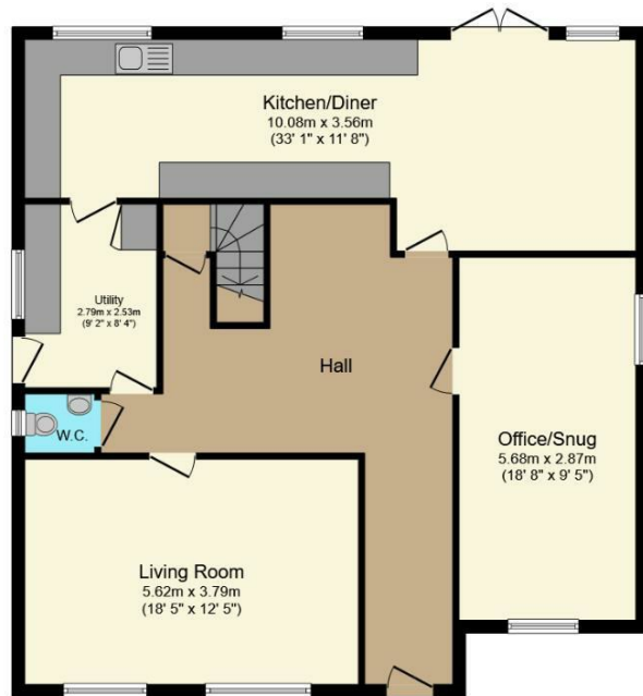
Ground Floor Floor area 108.2 sq.m. (1,165 sq.ft.)