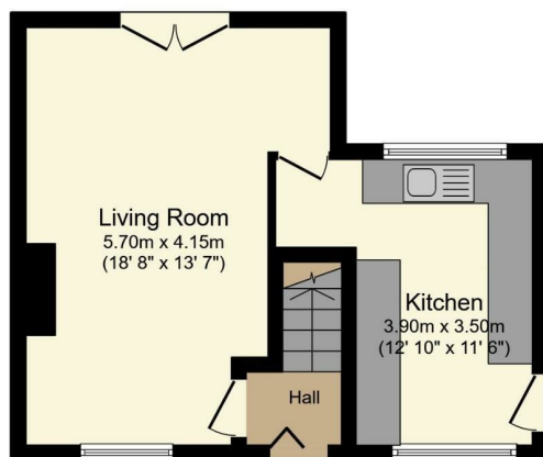
Ground Floor Floor area 34.4 m 2 (370 sq.ft.)