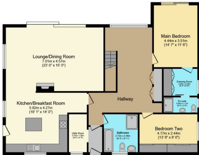
Ground Floor Floor area 127.8 m 2 (1,376 sq.ft.)