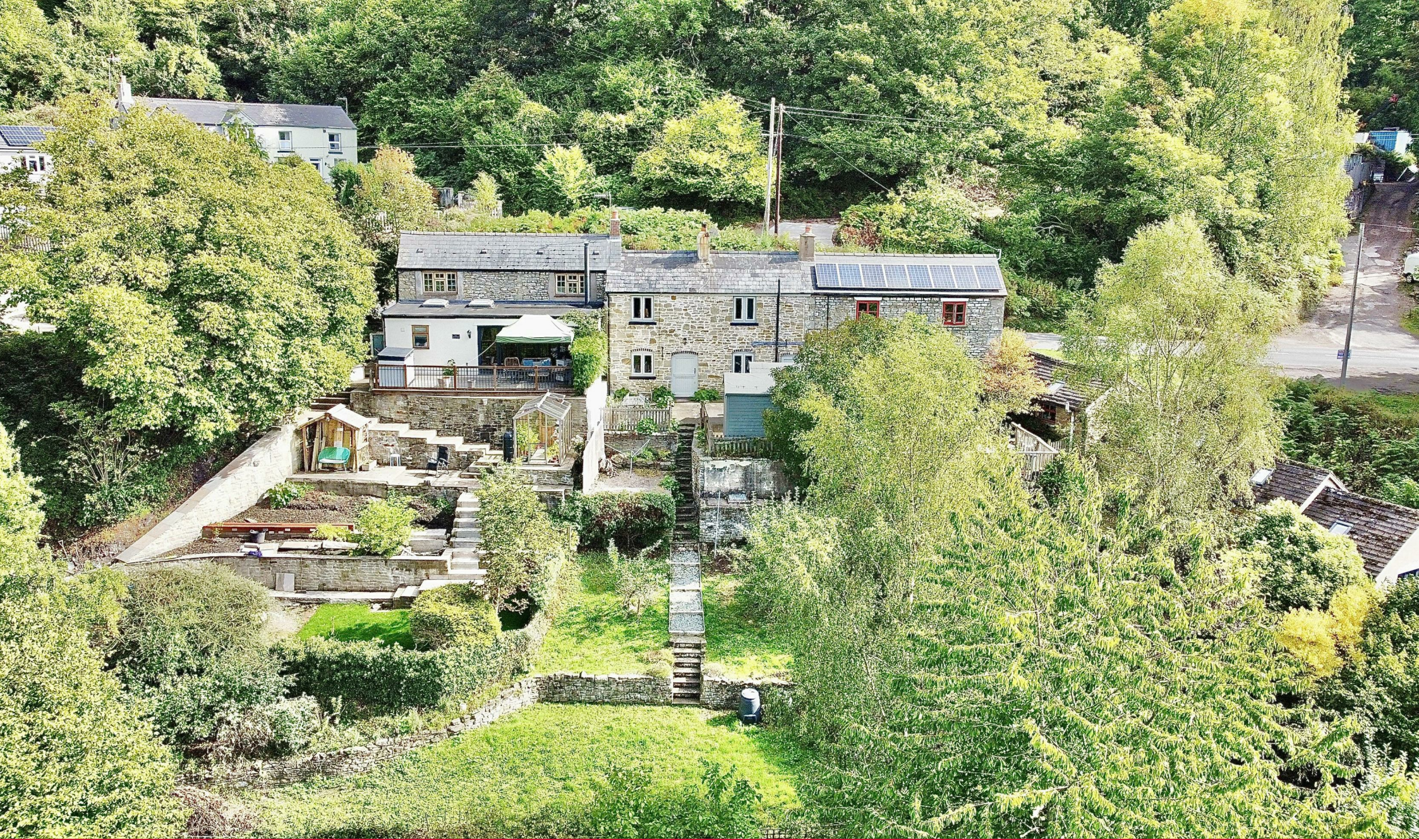
Church View Cottage Church Hill Lydbrook GL17 9SW