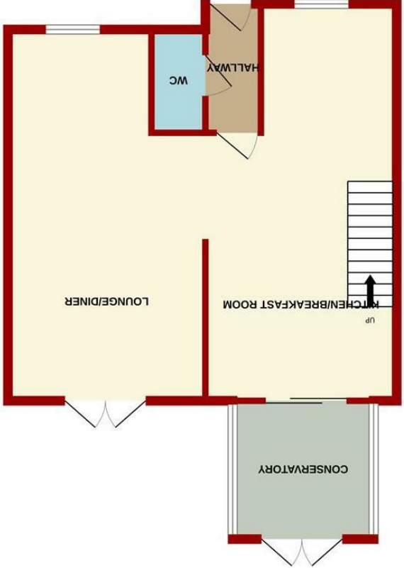
GROUND FLOOR 630 sq.ft. (58.5 sq.m.) approx.

TOTAL FLOOR AREA : 1186 sq.ft. (110.2 sq.m.) approx. Measurements are approximate. Not to scale. Illustrative purposes only. Made with Metropix ©2025