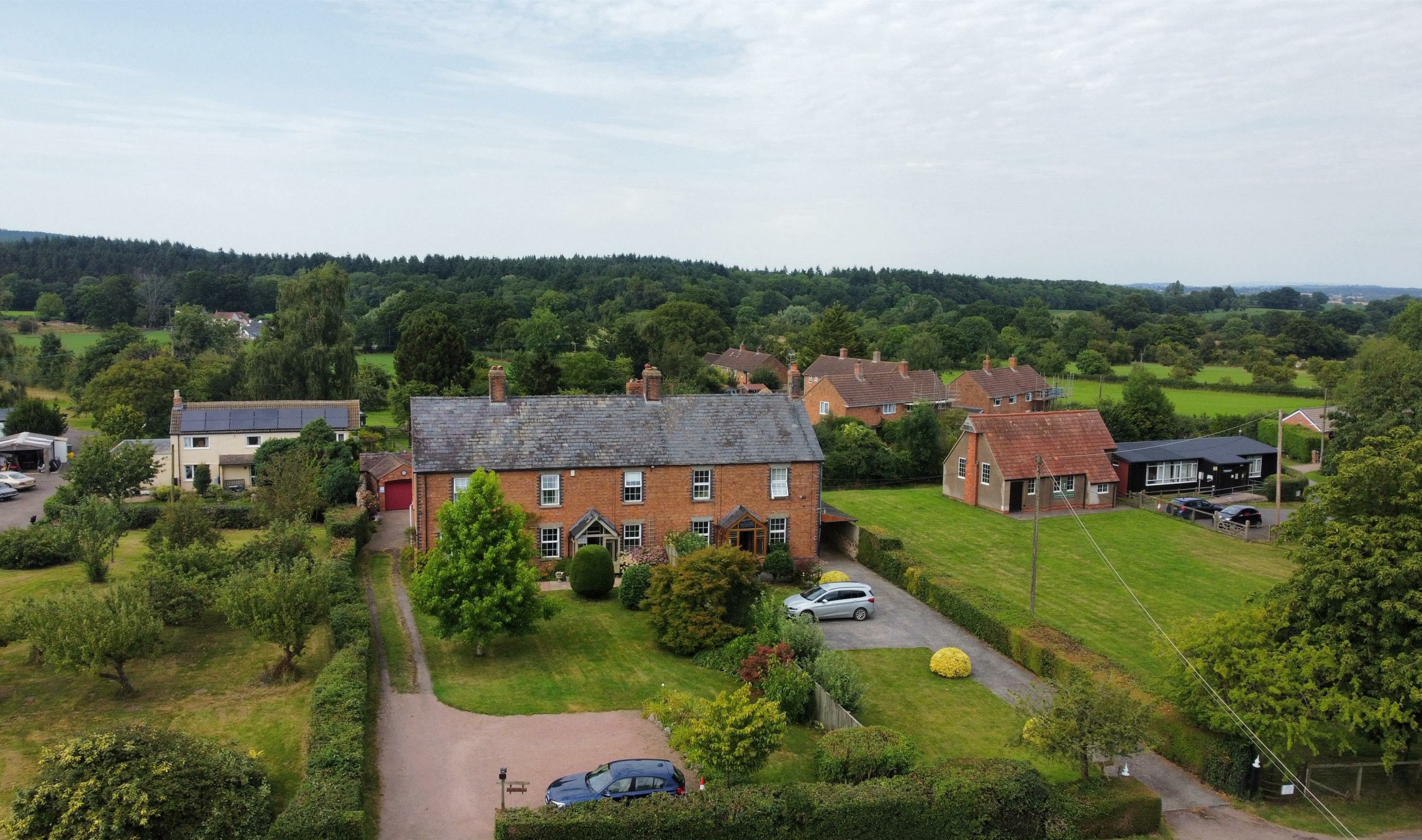
Gordon House Northwood Green Westbury-On-Severn GL14 1NA