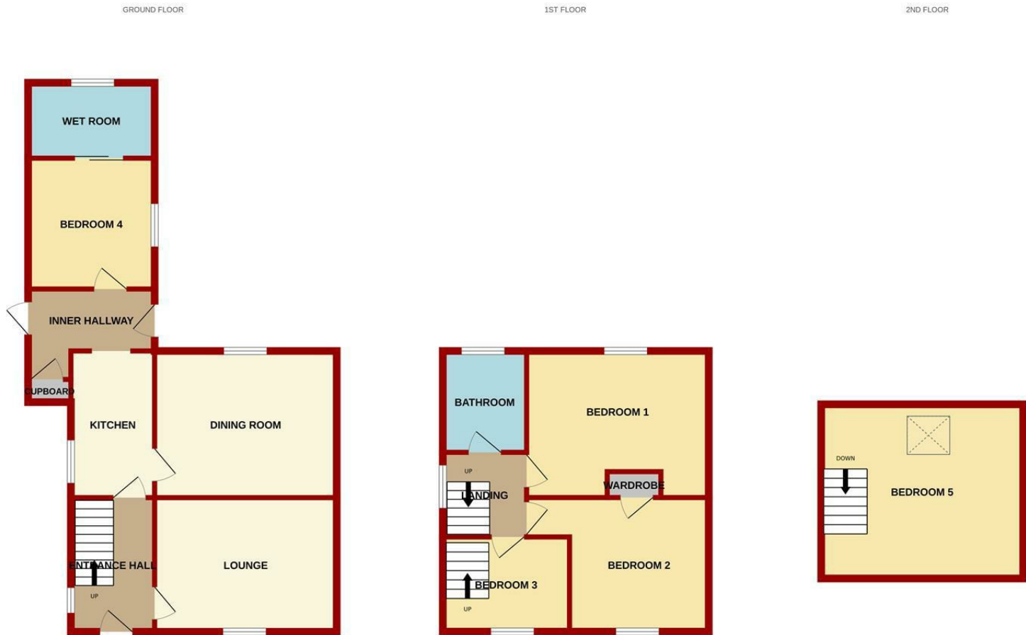
Measurements are approximate. Not to scale. Illustrative purposes only Made with Metropix ©2024