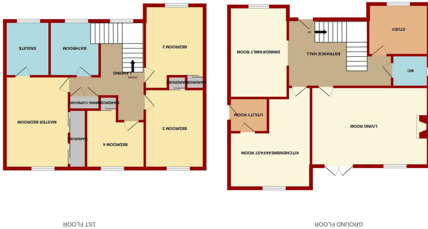
Measurements are approximate. Not to scale. Illustrative purposes only. Made with Metropix ©2024