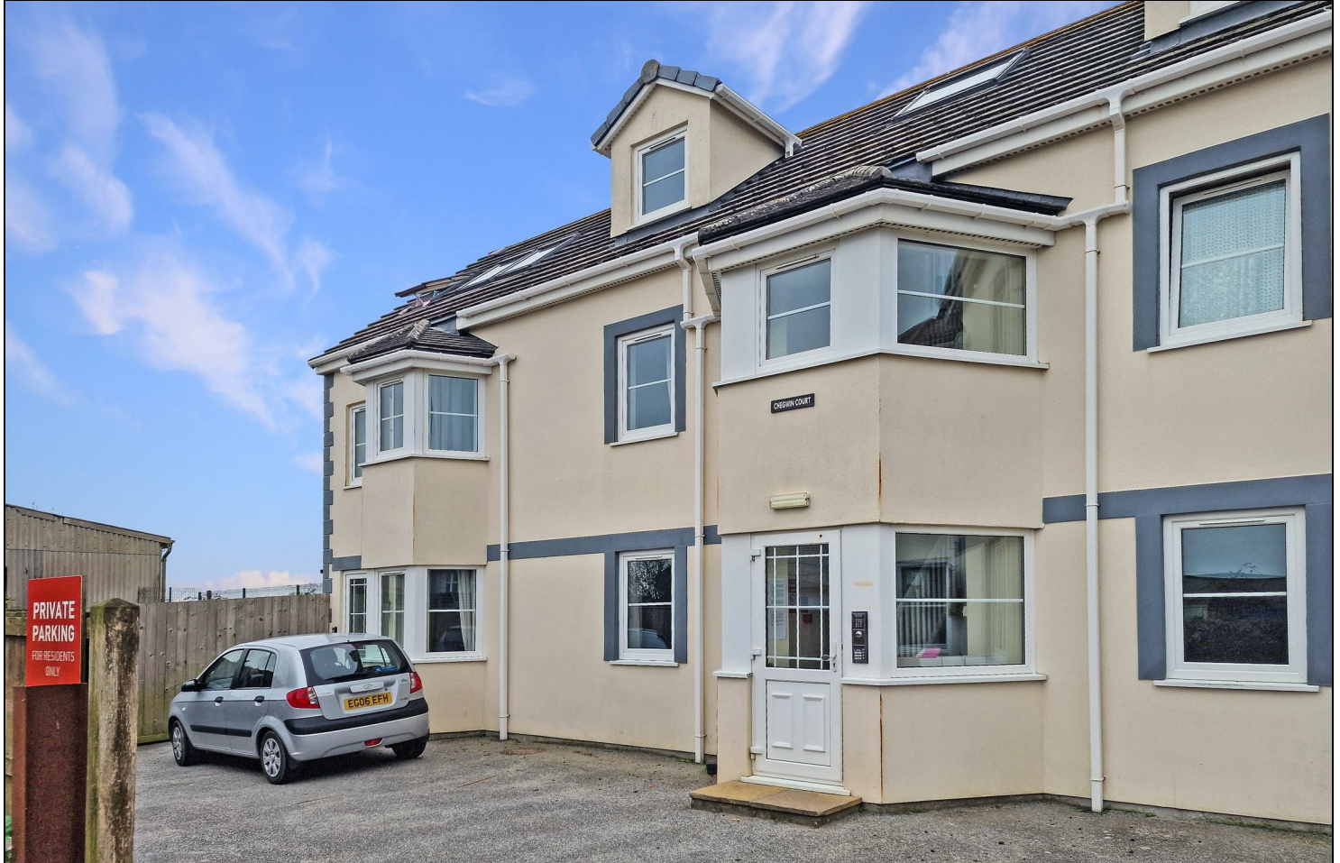
Ground Floor 2 Bedroom Apartment in Central Newquay.