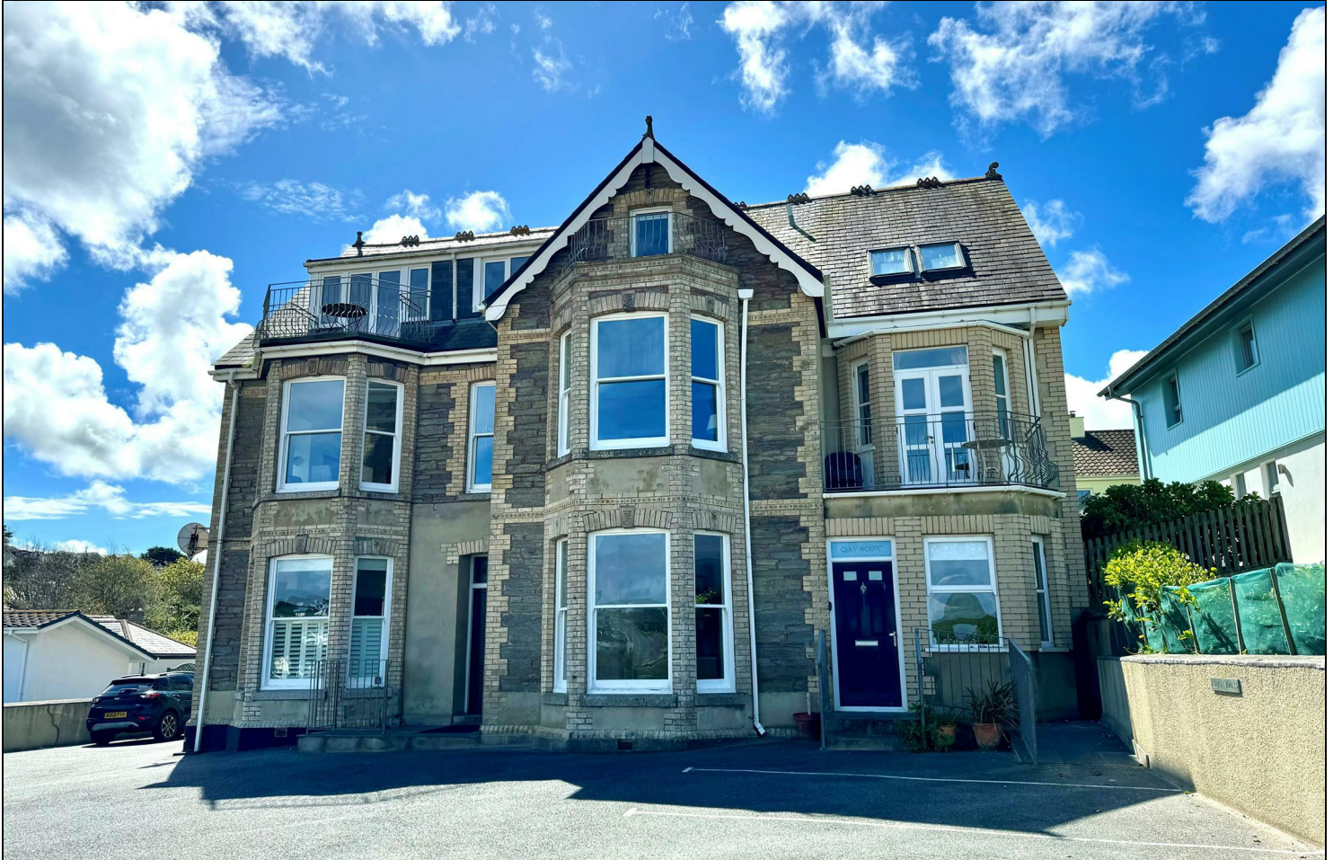
Beach side ground floor 2 bedroom apartment with views of Porth Beach.