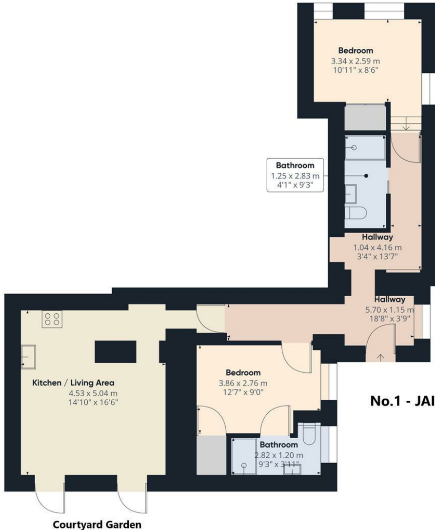
No.1 - JAIL HOUSE