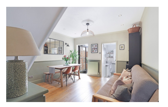
39 Allnutts Road Epping, Essex, CM16 7BE