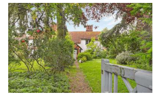
10 High Street Epping, Essex, CM16 4AB