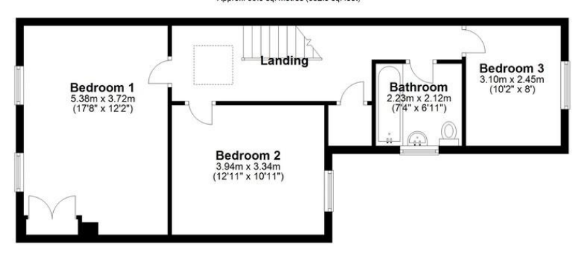
Total area: approx. 119.6 sq. metres (1287.9 sq. feet)