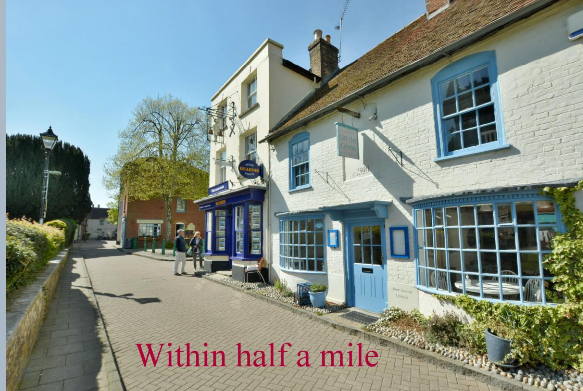
Within half a mile