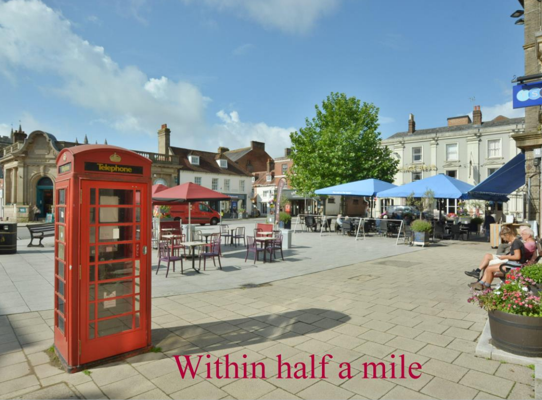
Within half a mile