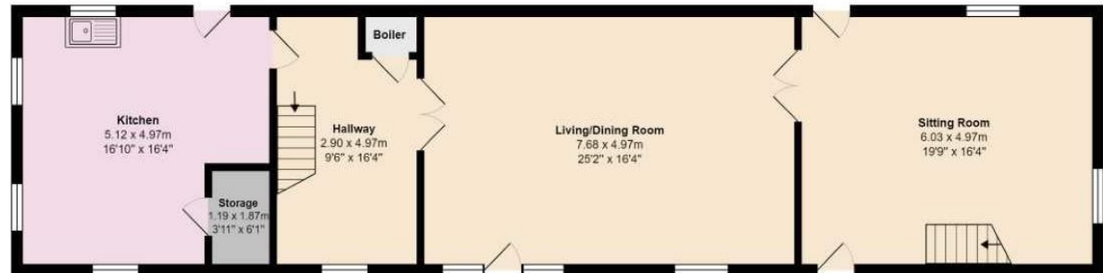
The Granary, Poynton Telford, SY4 4JN