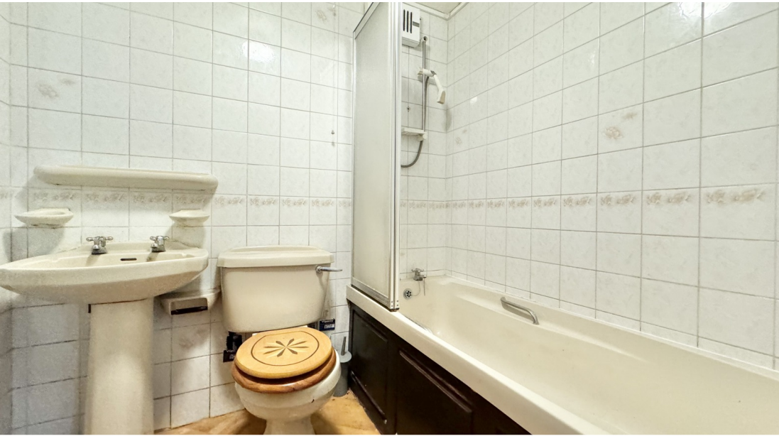
Cash buyers only!

Call Tudor Sales & Lettings on 0113 282 3056 for more information or to arrange a viewing.