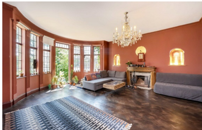
Goodyers Gardens, NW4