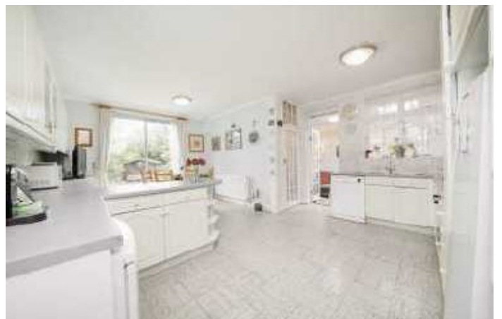
Talbot Crescent, NW4