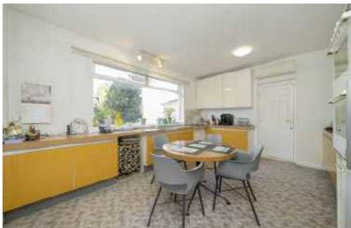
Allington Road, NW4