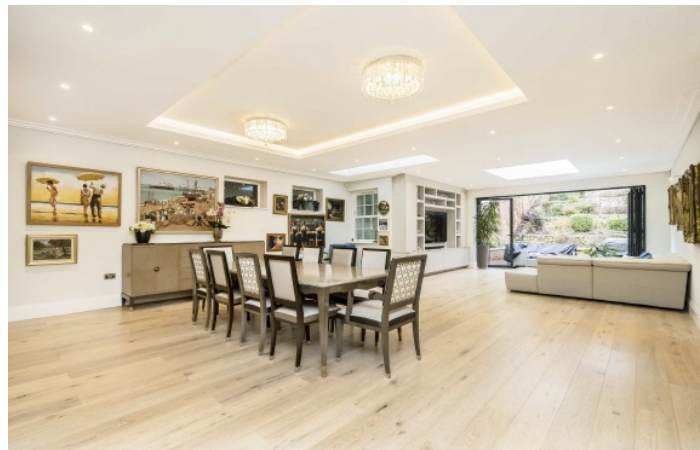
Tenterden Grove, NW4