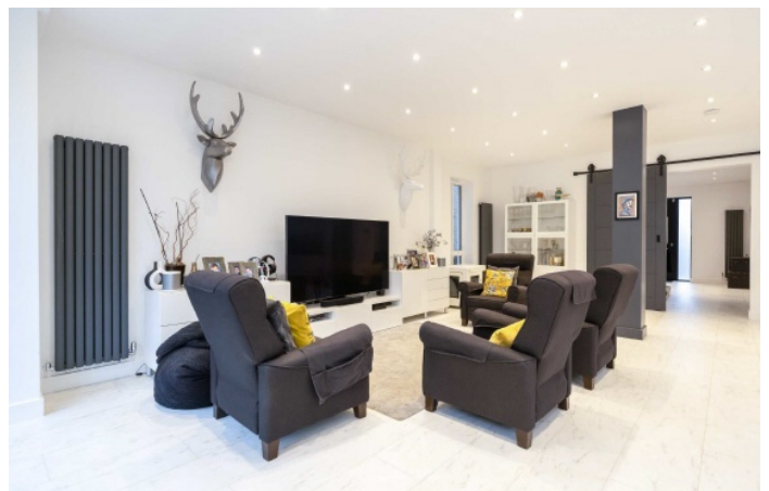
Rundell Crescent, NW4