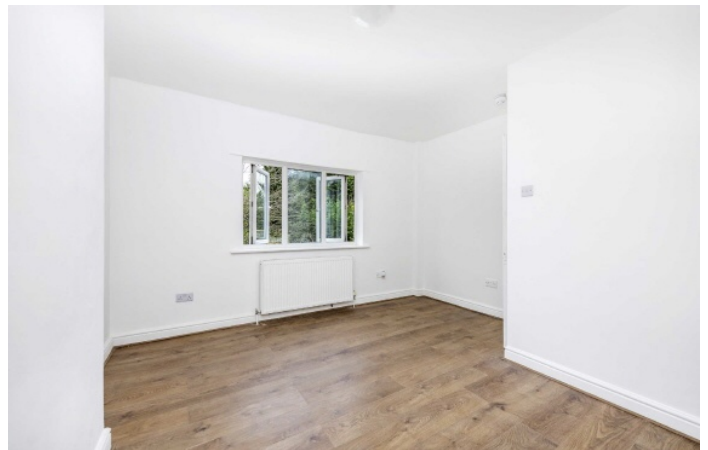
Rundell Crescent, NW4